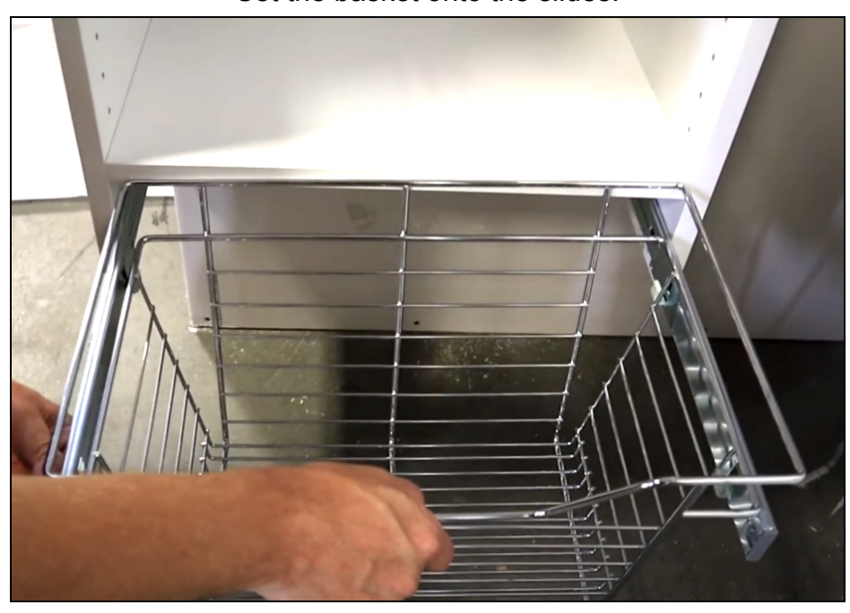
Set the basket onto the slides.

Shelf above the basket should use Rafix Connector Studs in the 2nd hole above the sliding basket rails.