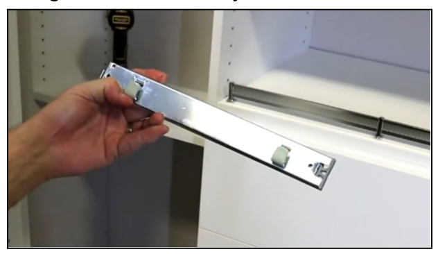
Extend the slides and fasten each to the vertical panel using euro screws in the system holes.

Identify the left and right basket slides by the orientation of the basket hooks.