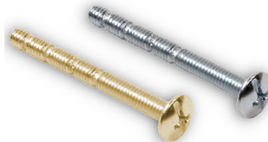
Breakaway Screws (Gold / Silver)

When purchasing your first closet you will receive a supply of fasteners adequate to complete the installation of your storage system. On your next closet order you will need to include a parachute bag stocked with a supply of fasteners. Please see the "Parachute Bags & Fasteners" guide/video for details.