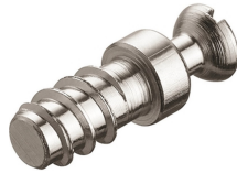
Rafix Connector Stud