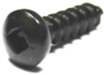
Pan Head Screw (5/8")