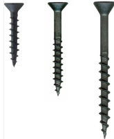
Wood Screws (1¼", 2", 3")