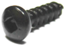
Pan Head Screw (⅝")