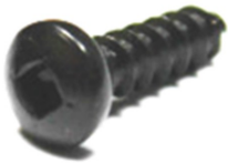
Pan Head Screw (⅝")